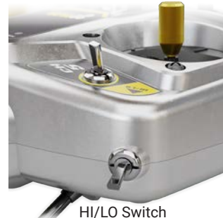
In the down position

M.Bus is a communication protocol that allows you to use one physical port on the receiver to control multiple servos. Each servo must be M.Bus capable and programmed to be on a particular digital channel.