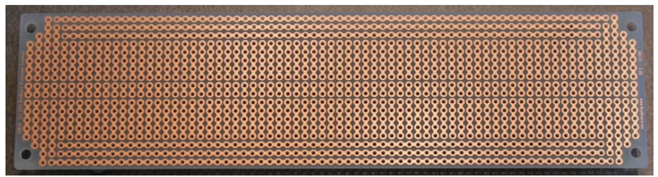
SB830 – Bottom Side Copper